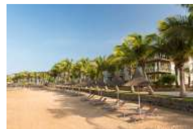
Beach-side at the Terrou-Bi Hotel, Dakar

The AISA School Heads Retreat is a new offering from AISA that was initiated in response to feedback from Heads of Schools who were seeking a forum where they could connect, share and learn together. The inaugural SHR2016 was a great success which has inspired us to make this a permanent feature of our annual programme. The SHR is strictly open to Heads of Schools only and we encourage all member schools to attend this unique event.