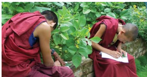
Students from Manjushri Di-Chen, Buddhist Learning Center, Kathamandu, Nepal

Challenge 20/20 brings together schools in the United States with schools in other countries. Together they identify local solutions to a global problem.